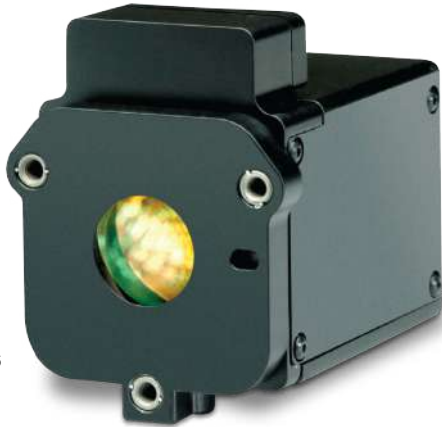
LIVAR® M506 Camera

The LIVAR® M506 Gated SWIR Camera System is ideal for covert operations and target identification, supporting lasers from 1.0 – 1.6 \mu\text{m} . Cost-effective, compact and lightweight, this range-gated, two-dimensional imaging camera operates in the eye-safe Short Wave Infrared (SWIR) band, provides day and night coverage, and supports mounted and dismounted operations. The camera system includes the camera, High Voltage Power Supply (HVPS) and Thermoelectric Cooler Controller (TECC). An optional high-PRF version is available that allows the use of low-power, high-PRF diode lasers with the camera in accumulation mode.